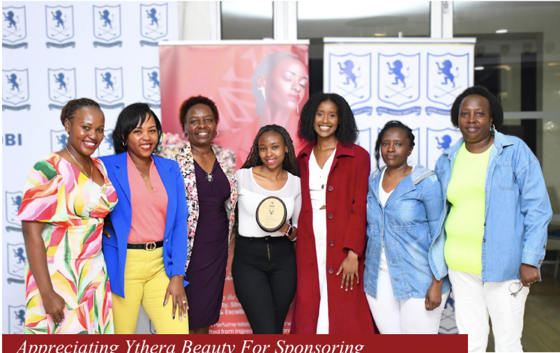
Appreciating Ythera Beauty For Sponsoring The Ladies Stableford No 8