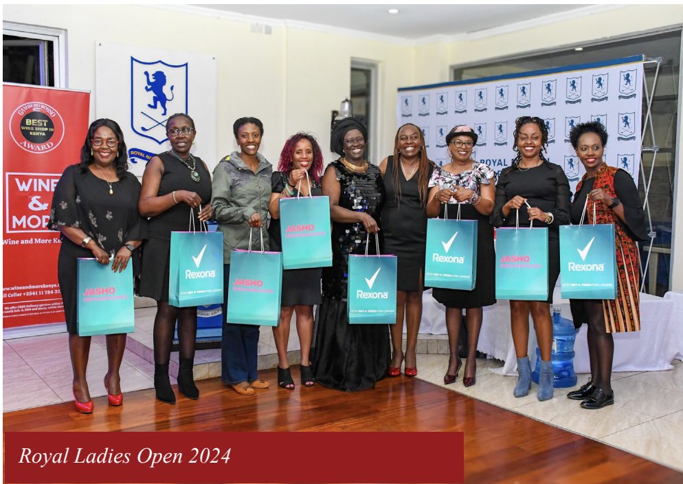
Royal Ladies Open 2024