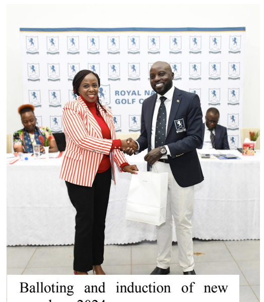
Balloting and induction of new members 2024