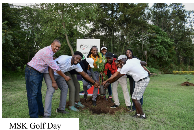
MSK Golf Day