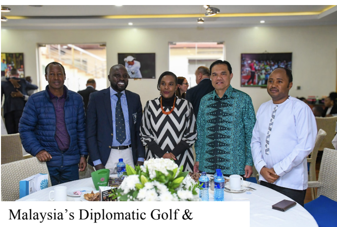
Malaysia's Diplomatic Golf & Merdeka Reception